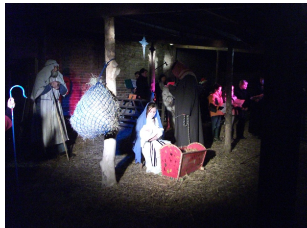
St Michael's 'Real Crib' Service

This year over 350 adults and children surrounded the barn sitting and standing on hay bales. It is a truly magical way to spend half an hour on the evening before Christmas.