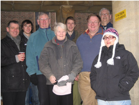
Volunteers that slept out last year

As 2012 dawns, Guildford YMCA faces a huge financial challenge – to maintain and expand the work it does with disadvantaged young people across Surrey. And two events are coming up soon that can help meet that challenge – a Guildford town centre street collection and a winter sleep out.